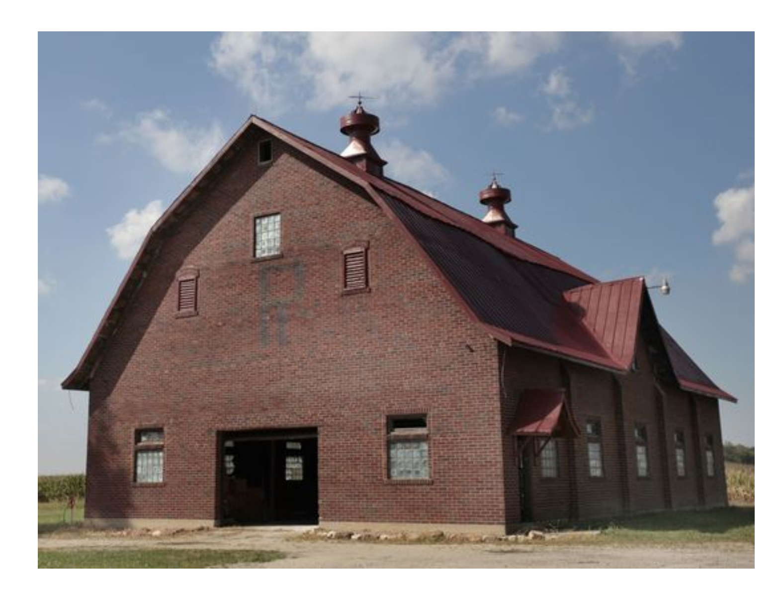
The Riggin Brick Barn

Riggin Road is likely named after the Riggin Family, he said. The family owned Riggin Dairy — also known as Rea Riggin & Sons — in the 1900s. In 1926, the operation was running for more than 15 years, supplying 1,200 gallons of milk daily at peak production, according to Star Press archives.